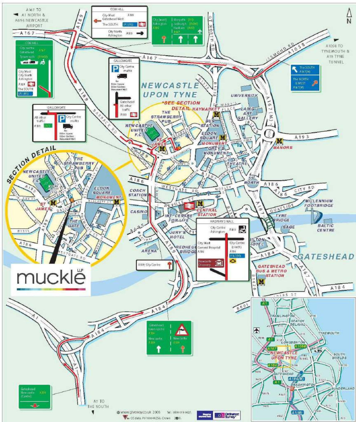
Map showing location of Muckle LLP

Name of organisation: Muckle LLP Address: Time Central 32 Gallowgate Newcastle upon Tyne NE1 4BF Telephone number: 0191 211 7777 Email: enquiries@muckle-llp.com Website: www.muckle-llp.com